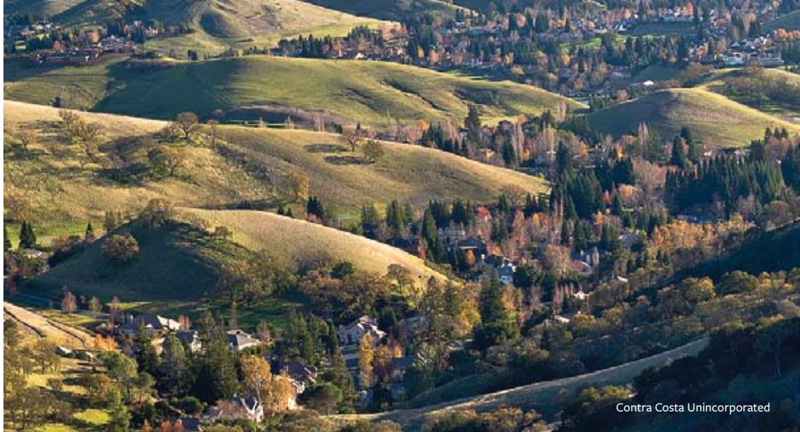
Contra Costa Unincorporated